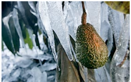
Figure C11.2: Avocado damaged by the January 2007 freeze.